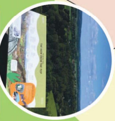
View from the top