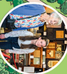
TV & Radio Exhibition