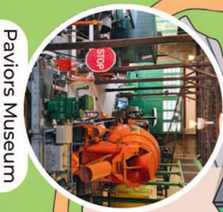
Paviors Museum of Roadmaking