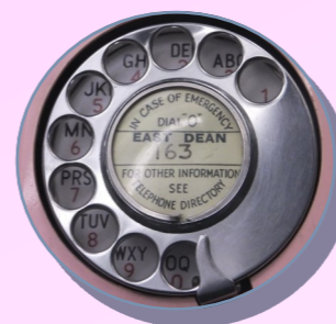
t _____ p _____ dial